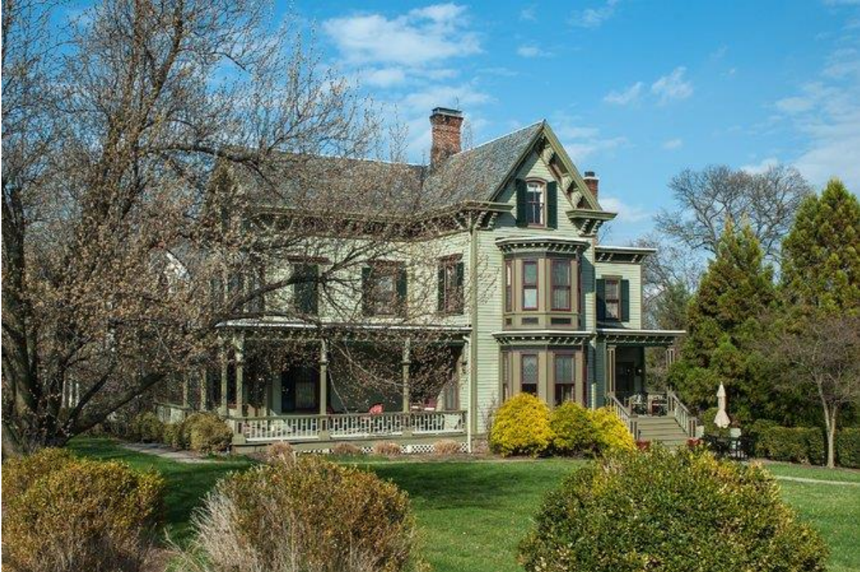
99 FAIRMOUNT AVENUE A five-bedroom four full- and two half-bath Victorian on 1.5 acres, listed at $1,995,000. (973) 615-9607

The quality of the school district, which serves both the borough and neighboring Chatham Township, both in Morris County, is frequently mentioned by residents and real estate agents as a motivation for house hunters there.