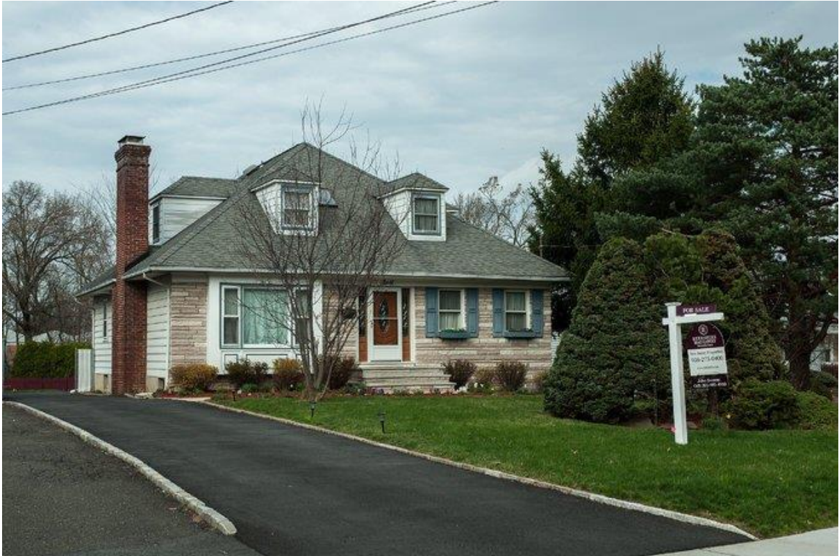
60 KINGS ROAD A four-bedroom three-bath 1970 house on 0.45 acres with a pool, listed at $675,000

Family recreation is a priority. Memorial Park Pool is open seasonally; borough residents pay $475 a year for a family of four or more. Four fields, two with artificial turf, bustle with young lacrosse and field hockey players and cheering adults.