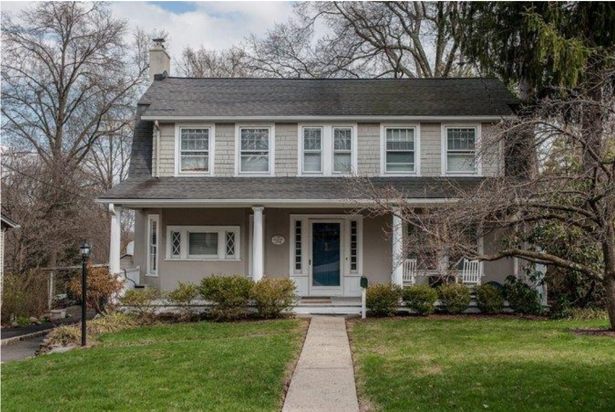
75 HILLSIDE AVENUE A four-bedroom two-and-a-half bath 1907 house on 0.33 acres, listed at $989,000. (973) 452-6318